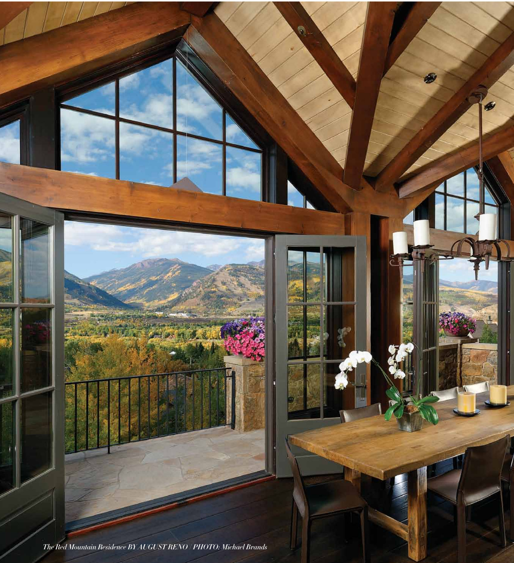
The Red Mountain Residence BY AUGUSTRENO