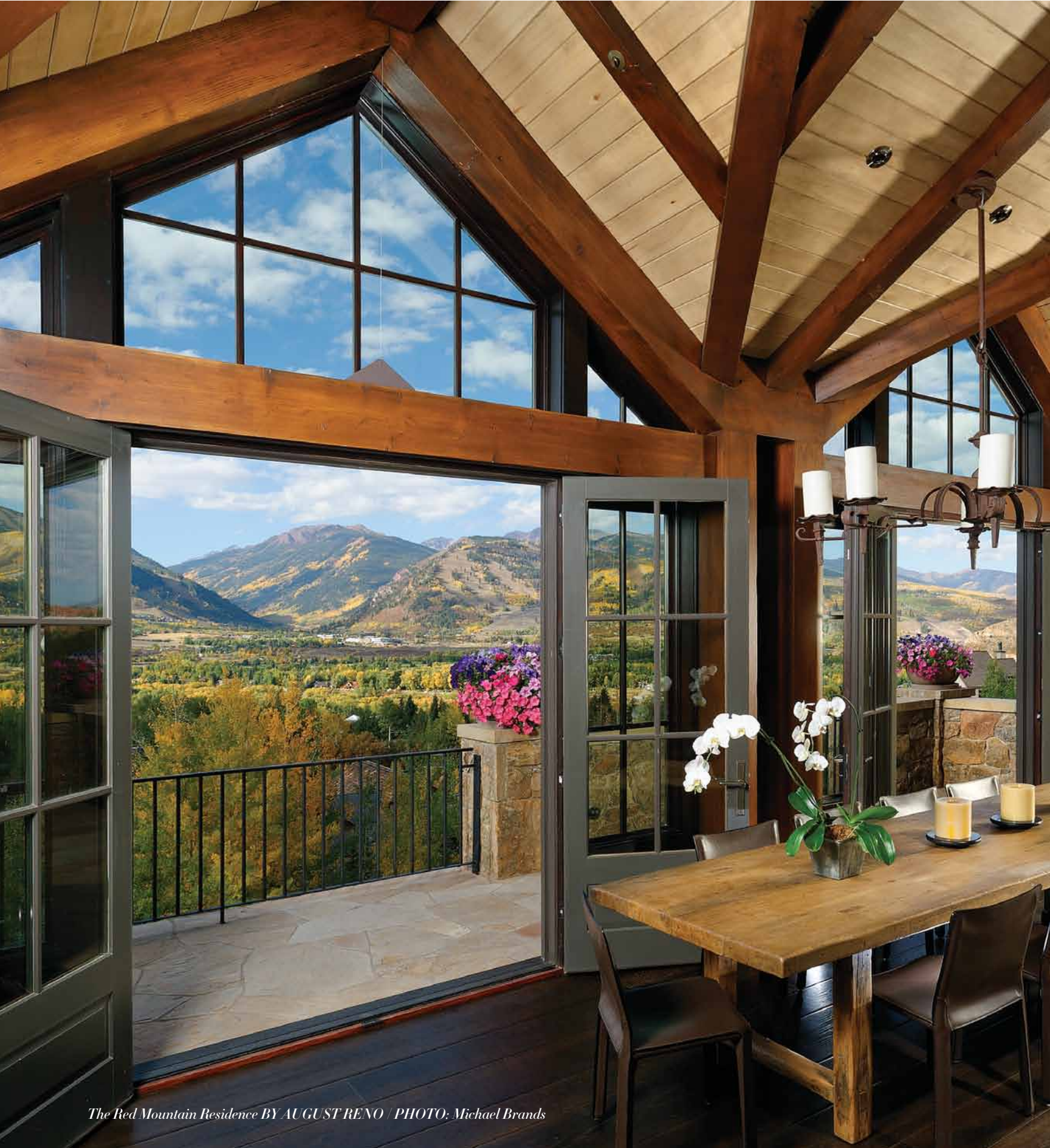
The Red Mountain Residence BY AUGUSTRENO